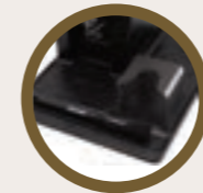
Mignon Mat Kit