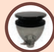
Blow-up Hopper (Mignon)