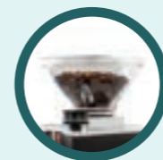
Mignon Single Dose Hopper