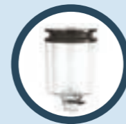
Blow-up Hopper (non-Mignon)