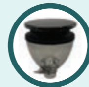
Blow-up Hopper (Mignon)