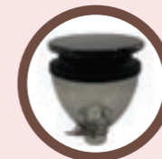
Blow-up Hopper (Mignon)