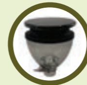
Blow-up Hopper (Mignon)