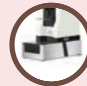
Mignon Knock Drawer