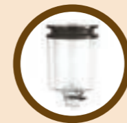
Blow-up Hopper (non-Mignon)