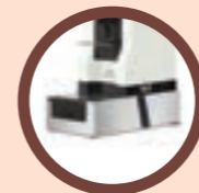
Mignon Knock Drawer