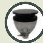
Blow-up Hopper (Mignon)