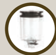
Blow-up Hopper (non-Mignon)