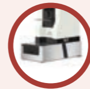
Mignon Knock Drawer