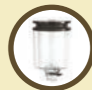
Blow-up Hopper (Non-Mignon)