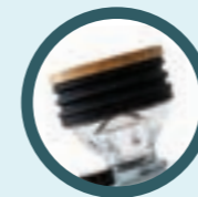
Replacement Blow Bellow