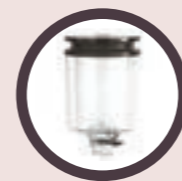
Blow-up Hopper (non-Mignon)