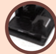
Mignon Mat Kit