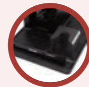
Mignon Mat Kit