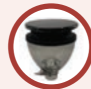
Blow-up Hopper (Mignon)