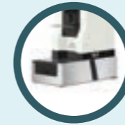
Mignon Knock Drawer