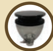
Blow-up Hopper (Mignon)