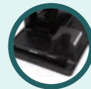
Mignon Mat Kit