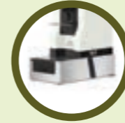
Mignon Knock Drawer