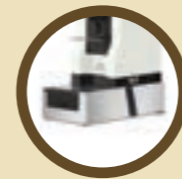
Mignon Knock Drawer