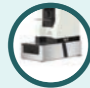
Mignon Knock Drawer