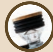
Replacement Blow Bellow