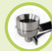
Mignon Libra Dosing Funnel Included