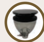
Blow-up Hopper (Mignon)