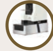
Mignon Knock Drawer