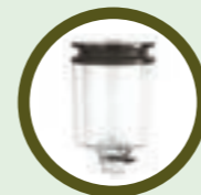
Blow-up Hopper (non-Mignon)