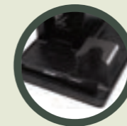
Mignon Mat Kit