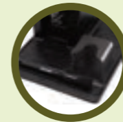
Mignon Mat Kit