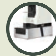
Mignon Knock Drawer