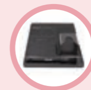
Mignon Mat Kit Included