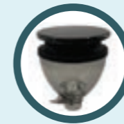
Blow-up Hopper (Mignon)