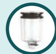
Blow-up Hopper (non-Mignon)