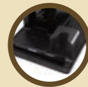
Mignon Mat Kit