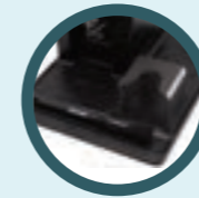
Mignon Mat Kit